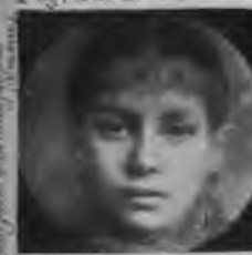
Fig. 31 (S. 1910)