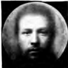
Fig. 11 Composite of 50