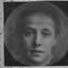
Fig. 30 (S. 1910)