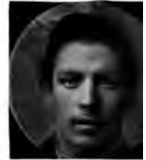
Fig. 12 Composite of 100