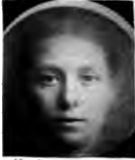
Fig. 4 Composite of 50