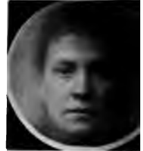
Fig. 3 Composite of 150