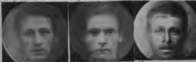
Fig. 26 (S. 1910)