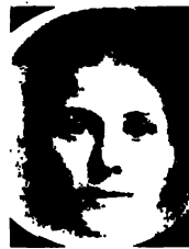
Fig. 9 Composite of 150