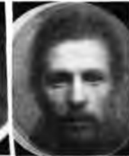
Fig. 19 Composite of 3.125