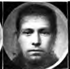
Fig. 15 Composite of 50