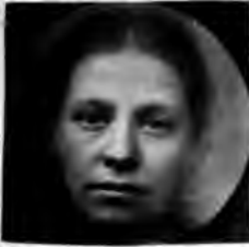
Fig. 1 Composite of 50