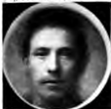
Fig. 13 Composite of 200