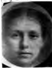
Fig. 7 Composite of 50