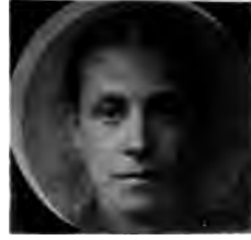
Fig. 2 Composite of 100