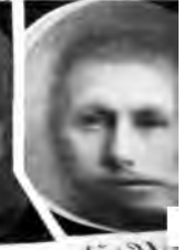
Fig. 21 Composite of 0.78125