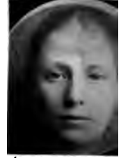
Fig. 6 Composite of 150