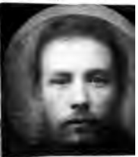
Fig. 16 Composite of 25