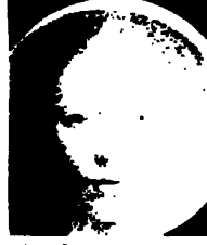
Fig. 5 Composite of 100