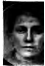
Fig. 10 Composite of 200