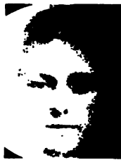
Fig. 8 Composite of 100