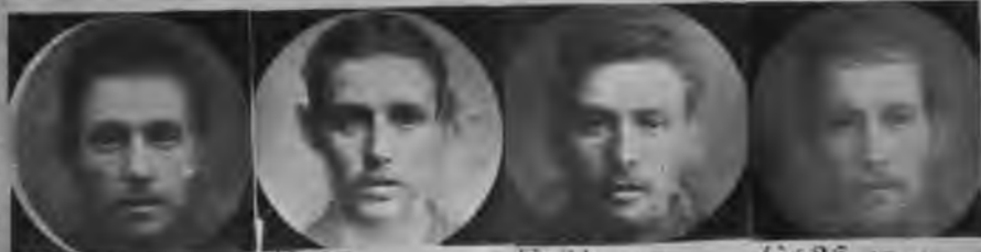
Fig. 22 (S. 1910)