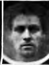
Fig. 18 Composite of 6.25