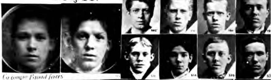
La compo Eyraud faces