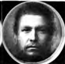
Fig. 14 Composite of 100