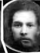
Fig. 20 Composite of 1.5625