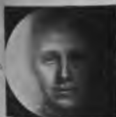
Fig. 29 (S. 1910)