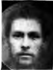
Fig. 17 Composite of 12.5