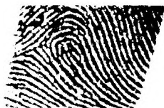
Enlarged for the remarkable pattern of r. 1.