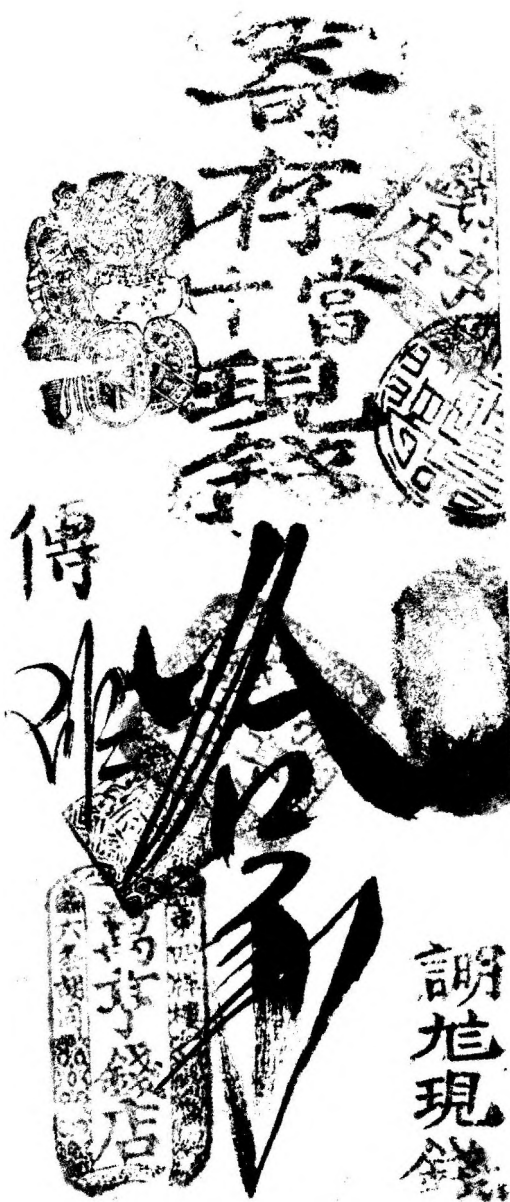
A CHINESE BANK NOTE, 1898