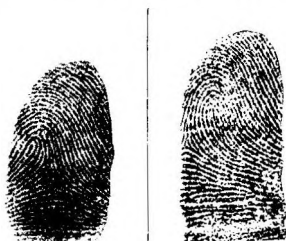
(a) r. 1 r. 2 (b) W. J. H., 1859, Arrah (aet. 26).

I close this record with a comparison between three of my own prints, taken, one in 1859, one in