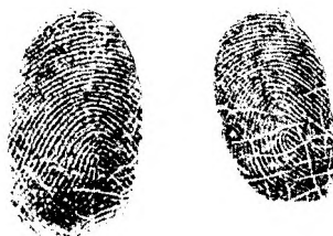
r. 1 r. 2 Sir Alfred C. Lyall, May 15, 1908.