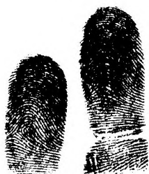
r. 1 r. 2 April 13, 1862. Mahārājā of Nuddea.

as I was, by the remarkable symmetry of the 'pattern' on one of his fingers at the core.