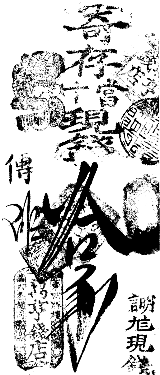
A CHINESE BANK NOTE, 1898