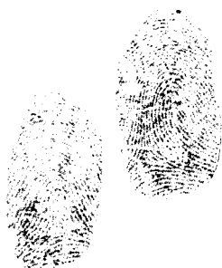
r. 1 r. 2 Sir A. C. Lyall, 1877.

led him to take special interest in my project, and I cannot doubt that he carried that with him to the Punjab, where his reputation was high. Most of the other saloon passengers were business men on their way back to the Far East, and left us at Ceylon.