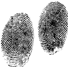
(c) r. 1