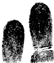
r. 1 r. 2 April 13, 1862. Mahārājā of Nuddea.

as I was, by the remarkable symmetry of the 'pattern' on one of his fingers at the core.