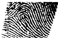
Enlarged for the re- markable pattern of r. 1.