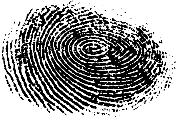
r 3 1877 (magnified)