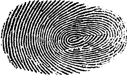
Repeat 1913 (magnified)