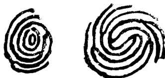
r. 1 l. 1 Enlargements by eye.

If any one of them had heard of the use of these marks, say in China, I could not but have been told of it. But there was not a breath of the sort. I give here a list of the remaining signatures still in my possession, in case any may meet with recog-