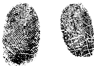
r. 1 r. 2 Sir Alfred C. Lyall, May 15, 1908.